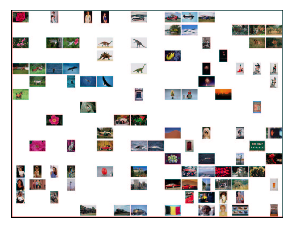
Fig. 1. The 16×16-sized TS-SOM level trained with the user interaction feature.

User-provided relevance evaluations are notably similar to hidden annotations [12]. In some occasions, the image database may contain elaborate manually-constructed captions or other annotations. Such annotated databases can be found eg. in commercial image libraries and medical databases. Implicit annotations can also be found, eg. from the text surrounding an image in the WWW. These annotations describe high-level semantic content of the image and often contain invaluable information for retrieval. Hidden annotations can be seen as high-quality user assessments. Images having a certain term in their annotations can be seen as the set of relevant images when the user was querying for images containing the concept corresponding to the term in question. Our technique can thus readily be utilized for keyword annotations.